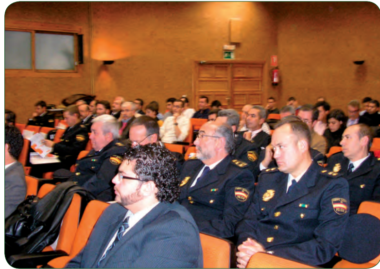
EQUAL TREATMENT SENSIBILIZATION TRAINING FOR THE LAW ENFORCEMENT FORCES

The Fundación Secretariado Gitano has continued to participate in and foster awareness-raising among the key agents in the fight against discrimination undertaking training and awareness-