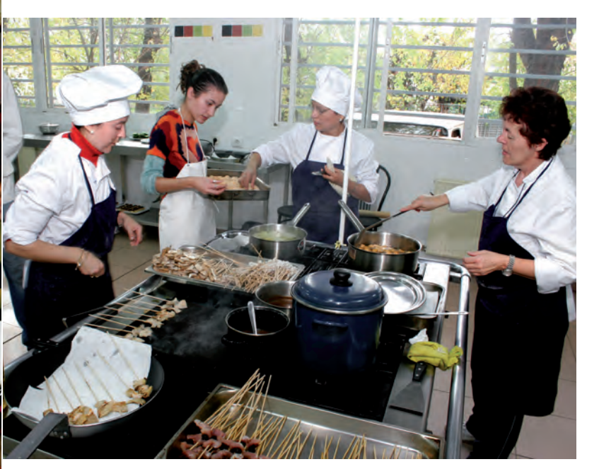
Cook class in Adalí Calí Centre, Madrid

This undeniable lack of preparation has clear consequences for Roma people's chances of gaining access to and holding down gainful employment because it clearly diminishes their labour options generally limiting their access to low-skilled sectors and jobs which tend to be unstable, precarious and offer little chance of sectoral mobility and professional advancement.