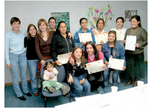
PARTICIPANTS OF THE HEALTH AND NUTRITION COURSE IN LUGO

studies conducted in each territory as well as professional initiation training courses within the framework of Social Guarantee.