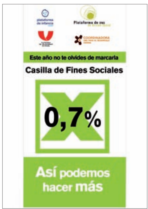
2009 "Social Purposes" campaign.