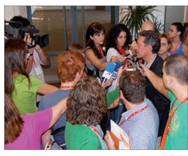
RESPONDING TO THE MEDIA.

The Area also actively participated on the Communication Committee of the Social Action NGO Platform which, in 2009, disseminated the advertising campaign on ticking the "Social Purposes" box on one's income tax statement and with the EAPNes Communication Group. And, this year once again the FSG formed part of the award committee for the European Commission Journalism Award called "For Diversity, Against Discrimination".