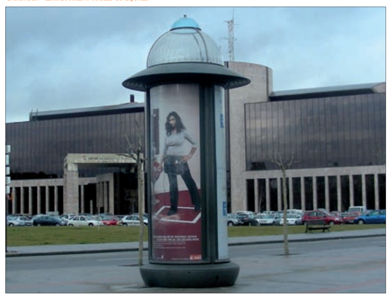
CAMPAIGN "EMPLOYMENT MAKES US EQUALS"

Having regard to the employment campaign - whose most representative symbol was the box - some actions were still being carried out in 2009 such as street billboard messages in some cities (posters on street furniture) and different Internet spots on the campaign's