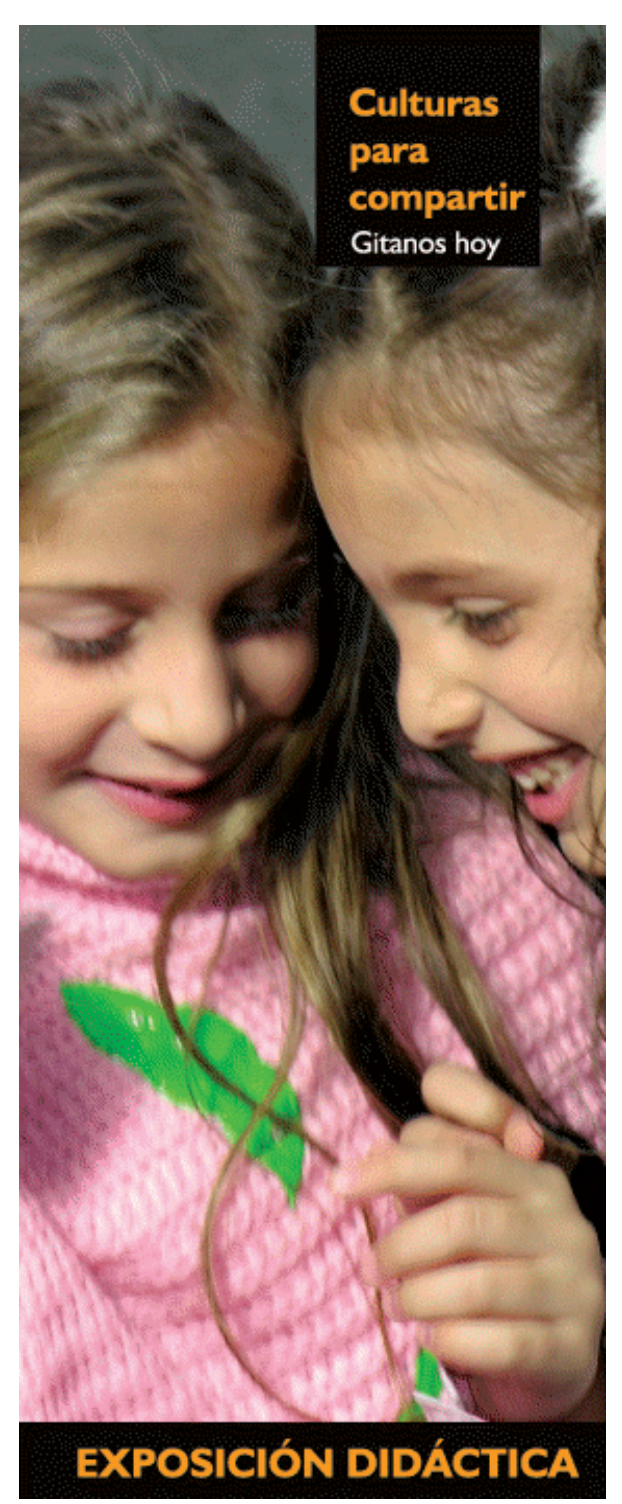
EXHIBIT "SHARING CULTURES. ROMA TODAY".

FSG actions to promote culture seek to make Roma culture visible in society.