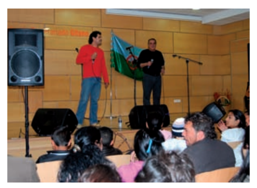
PERFORMANCE BY LOS CHICHOS AND LOS CHUNGUITOS AT THE APRIL 8TH CELEBRATION IN VALLECAS.

the FSG in Valladolid and videos entitled "Roma Expression" and "Past Times" done by the FSG in Barcelona.