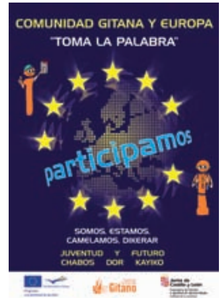
INTERNATIONAL SEMINAR ENTITLED “TAKE THE FLOOR” HELD IN PALENCIA.

As in the other activity organised by the FERYP, the FSG participated by collaborating on the training team and in the design of the activities programme. It also played an active role in the coordination of the activities undertaken and by participating in the evaluation and monitoring of the study session. It was likewise instrumental in fostering the participation of Roma youth from the different programmes run by the FSG.