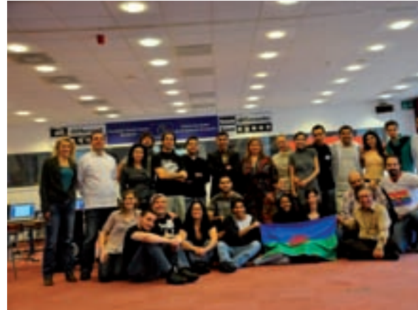
STUDY SESSION ENTITLED “DIVERSITY WITH AND WITHIN THE ROMA COMMUNITY” ORGANISED BY THE FERYP IN BUDAPEST

In 2009 we participated in statutory activities of the Spanish Youth Council and in the actions organised by the CJE through the Specialised Committees on Rights and Equal Opportunities and on Participation and Associative Advancement within the framework of the Citizenship Working Group and Social Movements.