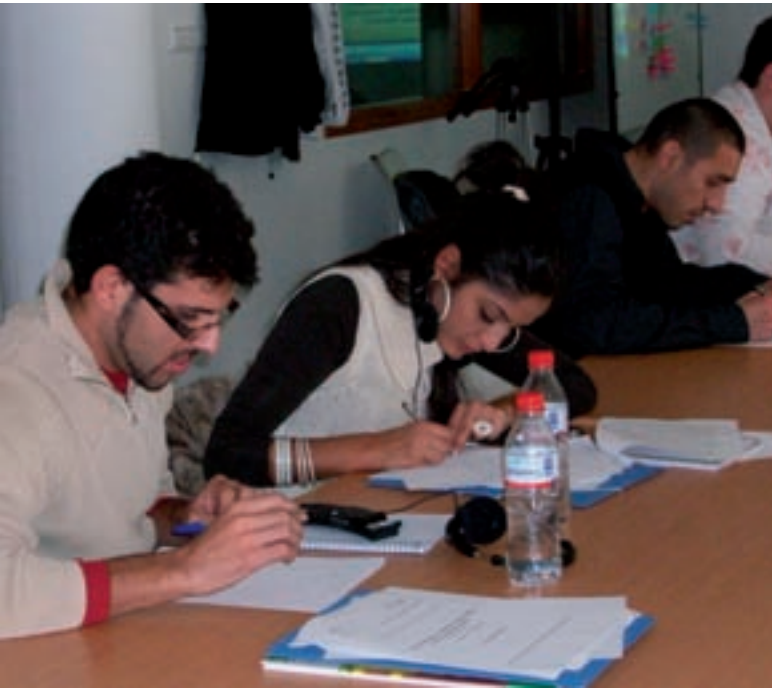
FSG PARTICIPANTS AT THE ADVISORY MEETING ON MIGRATION ORGANISED BY THE FERYP IN VALENCIA

One of the Roma community's major challenges is social participation which should play out not only in specifically Roma environments and structures but especially in shared areas together with all other citizens.