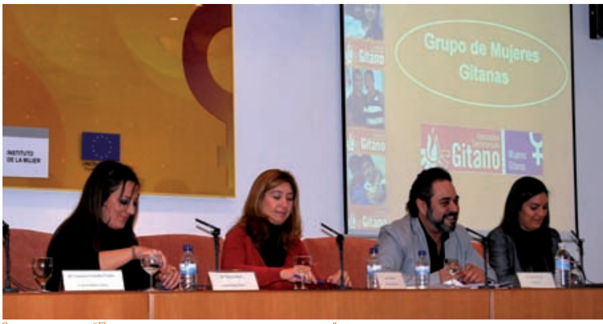
SEMINAR ENTITLED "EQUALITY IS AN ISSUE INVOLVING MEN AND WOMEN"

However, special mention should be made of the situation of multiple discrimination to which Roma women are subject as an ethnic group in Spanish society meaning that their situation is different from that of the majority insofar as they are affected by three factors: being women in a patriarchal society, belonging to an ethnic minority with the lowest social esteem and sharing a culture