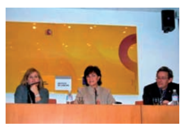
SEMINAR ENTITLED "EQUALITY IS AN ISSUE INVOLVING MEN AND WOMEN"

whose gender values have traditionally been associated with fulfilling the role of mother and wife thus lessening the likelihood of advancement.