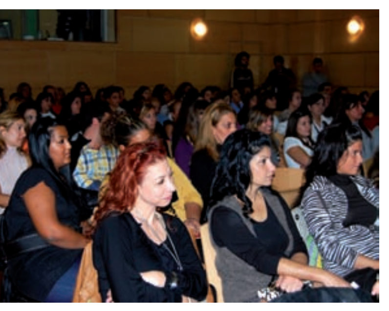
XIII NATIONWIDE ROMA WOMEN'S CONFERENCE