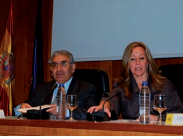
INAUGURATION OF THE NATIONAL SEMINAR ENTITLED "TOWARDS HEALTH EQUALITY, REDUCING INEQUALITIES WITHIN A GENERATION"

In 2006, the then Ministry of Health and Consumer Affairs and the Fundación Secretariado Gitano conducted the first National Health Survey of the Roma population with the specific aim of obtaining a diagnosis of the health status of Spain's Roma Population and detecting health inequalities affecting this community. The survey was conducted thanks to a collaboration agreement between the Ministry of Health and Consumer Affairs and the Fundación Secretariado Gitano in 2003 (2003-2008) with a view to improving the health and living standards of the Spanish