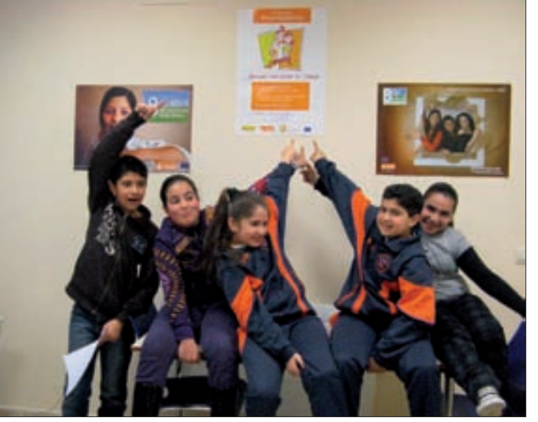
THE PROMOCIONA CLASSROOM IN SALAMANCA

In 2009, pilot experiences were carried out in eight Autonomous Communities (14 centres): Andalusia, Asturias, Cantabria, Castile-Leon, Galicia, Madrid, Murcia and Navarre. Agreements were reached with 86 schools and a total of 208 students and 179 families were tutored.