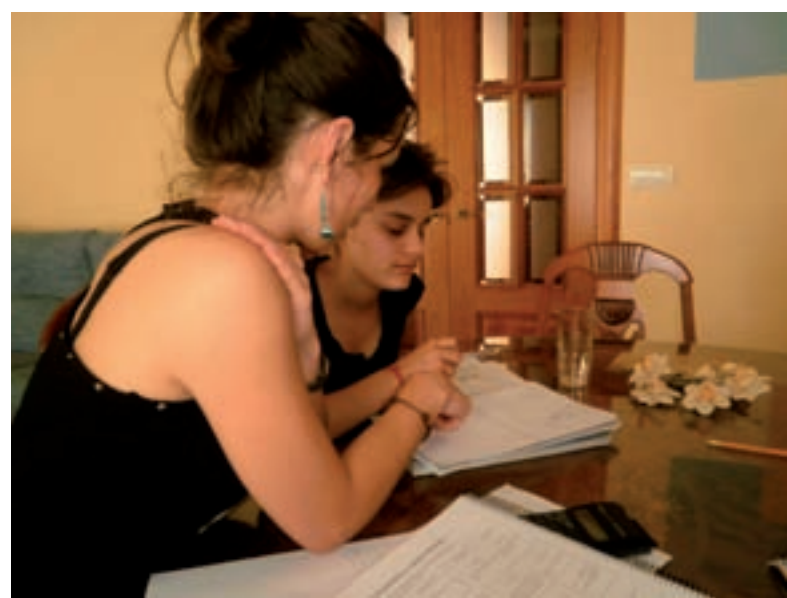
Socio-educational follow-up in \ensuremath{G}\xspace{\ensuremath{\mathsf{RANADA}}}