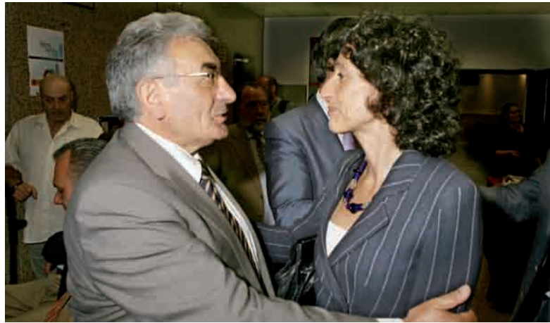
THE PRESIDENT OF THE FSG WITH THE MINISTER OF EDUCATION, SOCIAL POLICY AND SPORTS.