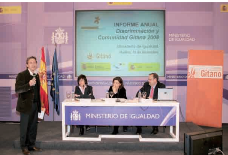
PRESENTATION OF THE 2008 DISCRIMINATION REPORT.

In our country and beyond national borders, Acceder has become a benchmark programme for the socio-labour intervention with Roma. It is safe to say that it is the only European programme which has proven effective in facilitating access to training and employment for Roma throughout Europe and in contributing to a change of mentality amongst Roma families and government administrations who have changed their view and expectations as concerns intervention with the Roma community. The Programme's conceptualisation and methodology and its management have made these results possible. With a view to reinforcing this recipe for success, this year a document on the Acceder methodological model has been drafted and