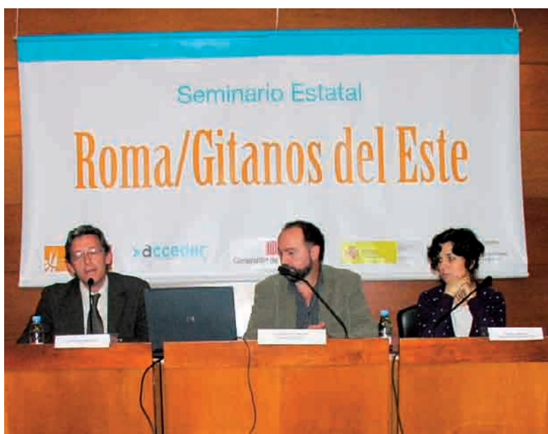
THE I WORK SEMINAR WITH EASTERN EUROPEAN ROMA HELD IN BARCELONA.

Galicia is another example of marked growth and expansion