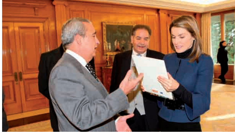
LETIZIA ORTIZ ROCASOLANO WITH MEMBERS OF THE BOARD OF TRUSTEES DURING THE AUDIENCE THEY WERE GIVEN.

In addition to participation in these fora, other political or institutional activities have been undertaken such as: drafting and submission of proposals for inclusion in the new Roma Development Plan, participation in the drafting process of the National Plan for Social Inclusion 2008-2010, participation in the First European Roma Summit (Brussels, 16 September) and meetings with members of the Government to support defence of Roma inclusion policies in Europe and to make the latter a priority during the Spanish EU presidency in 2010.