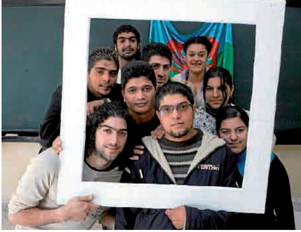
THE FSG-ALICANTE TEAM POSES WITH THE "BOX", THE MAIN ELEMENT OF THE CAMPAIGN ENTITLED "EMPLOYMENT MAKES US EQUAL".

into new towns where we should highlight the relevance of initiatives such as the eradication of shanty towns which the administration is undertaking in collaboration with the FSG.