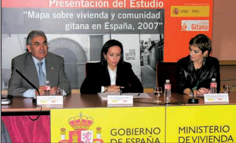
THE PRESIDENT OF THE FSG, THE MINISTER OF HOUSING AND THE DIRECTOR OF HOUSING DURING THE PRESENTATION OF THE HOUSING MAP.

will be published and disseminated next year for the purpose of increasing awareness of the programme's work methodology therefore promoting better adaptation in different contexts.