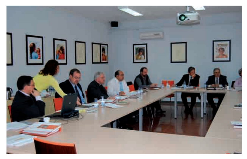
MEETING OF THE BOARD OF TRUSTEES ON 18 NOVEMBER.