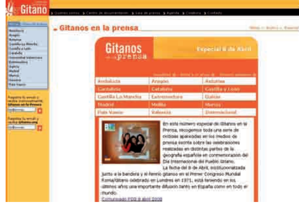
ROMA IN THE NEWS. WEB SECTION OF THE REGULAR PUBLICATION OF THE DOCUMENTATION CENTRE.

This is a support resource for education professionals working in culturally heterogeneous educational contexts with Roma students or students from other cultural groups. This is a selection of materials designed for use by schools, associations, institutions and public and private organisations to teach values and intercultural co-existence and to increase awareness of the Roma community.