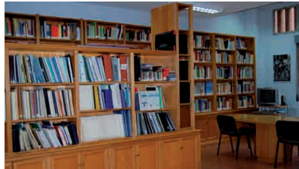
FSG DOCUMENTATION CENTRE

teaching material, etc.) which can be viewed and heard at the Documentation Centre itself.