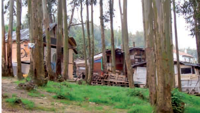
NEARLY 4% OF THE HOMES INHABITED BY ROMA ARE IN SHANTY TOWNS.

There are still over 10,000 sub-standard homes inhabited by Roma.