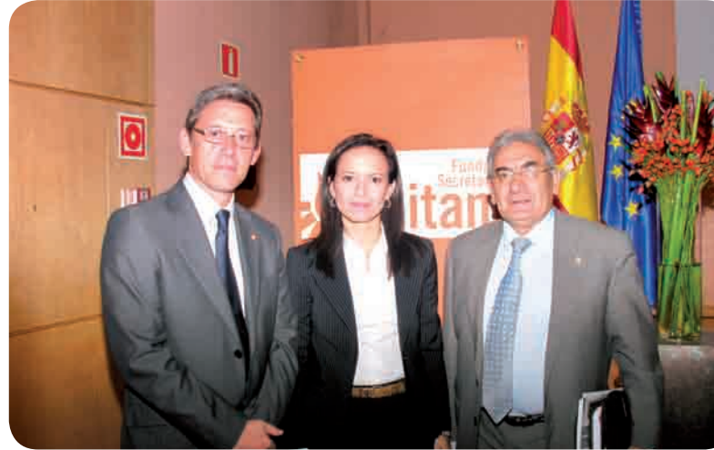
THE PRESIDENT AND THE DIRECTOR OF THE FSG ALONGSIDE THE MINISTER OF HOUSING AT THE PRESENTATION OF THE "ROMA COMMUNITY HOUSING MAP FOR SPAIN, 2007".

The other Autonomous Communities which are home to the Roma population in descending order of importance are Valencia (13.5%), Madrid (10.1%) and Catalonia (8.5%).