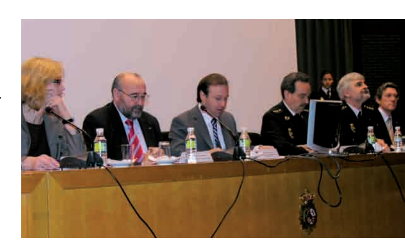
Inaugural presentation of the Seminar entitled "Get to know THE ROMA COMMUNITY" IN WHICH THE DIRECTOR-GENERAL OF THE NATIONAL POLICE FORCE AND THE CIVIL GUARD TOOK PART.

As has now become common practice, the FSG's Area of Equal Treatment has developed all of the strategic lines and actions needed to counteract the phenomenon of discrimination and foster the principle of equal treatment. The following are summarised below: