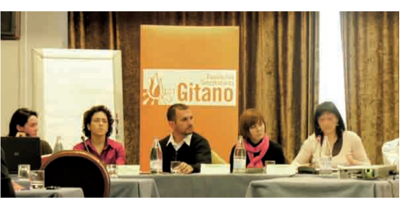
Training for Jurists and NGO's, "The role of Public Administrations and NGO's in combating ethnic and racial discrimination" held in Madrid.

Special mention should also be made of the periodic review on the FSG's web page (Area of Equal Treatment) of regulations currently in force, recommendations and decisions at European and international level, publications on