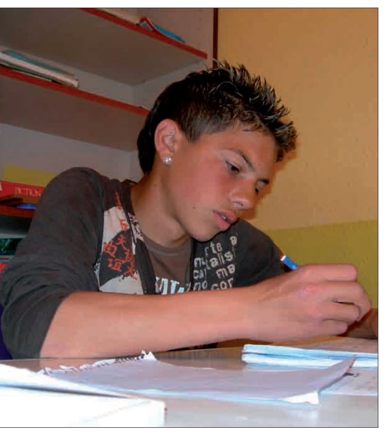
TUTORING SESSIONS IN NAVARRE.

Providing access to and promoting post-compulsory studies among the Roma community through the implementation of specific actions at national level subsidised by the Ministry of Education, Social Policy and Sports and funded through special income tax allocations. These actions consist mainly in the awarding of scholarships (a total of 200 students have received economic support), tutoring and the organisation of meetings with the participation of Roma students and their families along with professionals working in the educational and social fields.