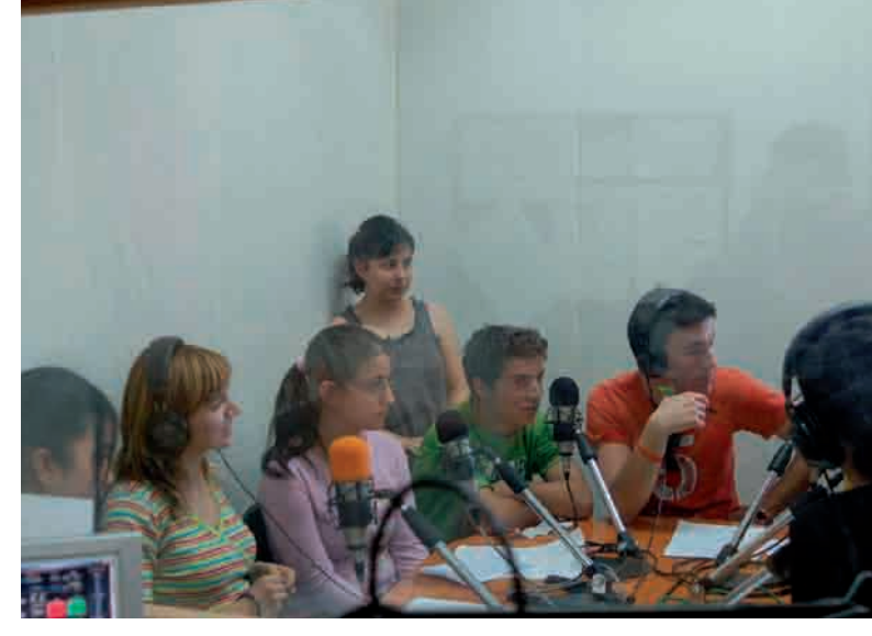
AFTER SCHOOL ACTIVITIES IN SALAMANCA

As concerns the academic level of Roma adults we find that seven out of every 10 Roma over the age of 15 are completely or functionally illiterate<sup>2</sup> which is 4.6 times higher than for the overall Spanish population according to the 2001 INE census. If we consider only the completely illiterate the comparative figures are even more dramatic showing that there are 5.2 times more vis-á-vis the overall Spanish population. This points to the clear need to obtain at least a basic level of education focused on acquiring fundamental instrumental skills