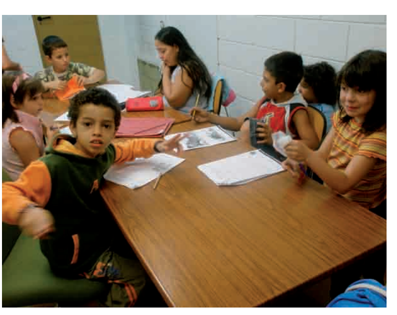
ACADEMIC SUPPORT ACTIVITIES AT SCHOOLS IN NAVARRE.

} Along these lines, in 2008 a specific programme called the Promociona Programme was designed within the framework of the Multi-Regional Operational Programme to Combat Discrimination 2007-2013 which will be implemented as from 2009 targeting students who are finishing primary school and moving on to secondary school and the families of these students. These actions are specifically aimed at those children who are in a standard school environment but who have been identified as requiring accompaniment to increase their likelihood of achieving their compulsory education degree and going on to post-compulsory studies. A special effort will be made at key moments such as the step from primary