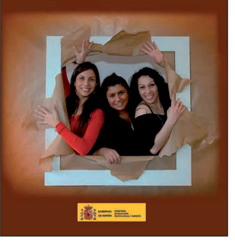
Publication "50 Roma students in Spanish society"

Article 26 of the Universal Declaration of Human Rights speaks to every person's right to education and provides that education shall be directed to the full development of the human personality and to the strengthening of respect for human rights and fundamental freedoms. It shall promote understanding, tolerance and friendship among all nations, racial or religious