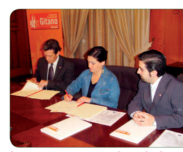
SIGNING OF THE AGREEMENT WITH THE CORDOBA CITY COUNCIL