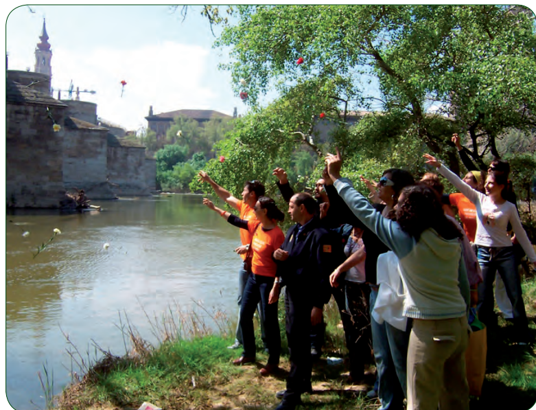
RIVER CEREMONY AT THE CELEBRATION OF INTERNATIONAL ROMA DAY