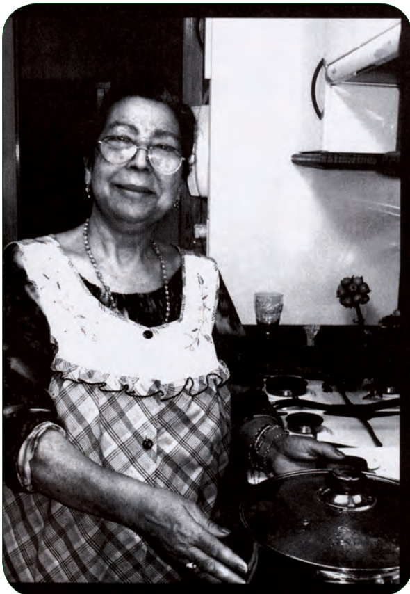
BOOK "SHARING ROMA RECIPES"