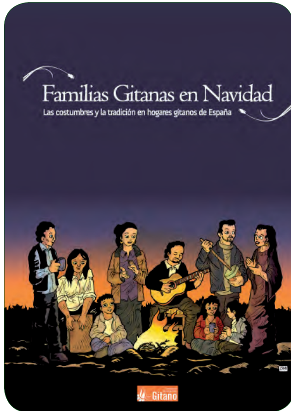
BOOK "ROMA FAMILIES AT CHRISTMAS"

Activities can be broken down into the following groups: