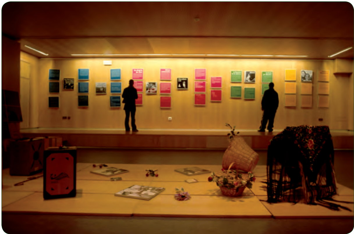
EXHIBIT "SHARING CULTURES, ROMA TODAY"

In an enlarged Europe, the Roma community is a very relevant sector of the population with approximately 10 million members. A significant proportion of the members of Europe's Roma ethnic minority remain immersed in a situation of social exclusion, subject to discrimination processes which limit the exercise of their rights and their access to resources and services, cultural included, which are readily available to the rest of Europe's citizens.