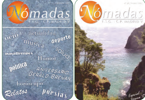
ISSUES OF THE NÓMADAS MAGAZINE PUBLISHED IN 2007

institution. The main objective is to promote the advancement of the Roma inmate population from a socio-educational and cultural perspective with a view to contributing to their reinsertion process.