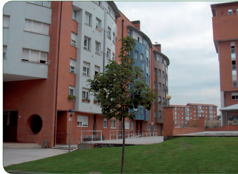
FIELDWORK FOR THE STUDY-MAP ON HOUSING AND THE ROMA COMMUNITY TOOK US TO ALL THE PLACES IN SPAIN WHERE ROMA LIVE.

Approximately 100 political decision makers took part in the I Reflection Conference on the Roma community and housing.