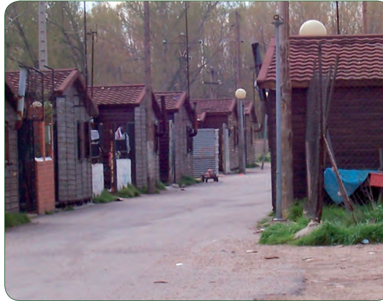
A SEGMENT OF THE ROMA COMMUNITY STILL SUFFERS FROM THE EFFECTS OF RESIDENTIAL EXCLUSION

whereby the said network extracted data concerning the Roma population from 1,700 Spanish municipalities. This major effort will provide us with updated and reliable information concerning where and in what type of neighbourhoods and conditions Spanish Roma are living thus making it possible to know the needs and shortcomings which still prevail.