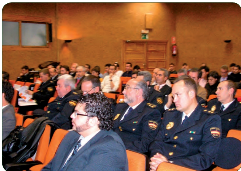
EQUAL TREATMENT SENSIBILIZATION TRAINING FOR THE LAW ENFORCEMENT FORCES

The Fundación Secretariado Gitano has continued to participate in and foster awareness-raising among the key agents in the fight against discrimination undertaking training and awareness-