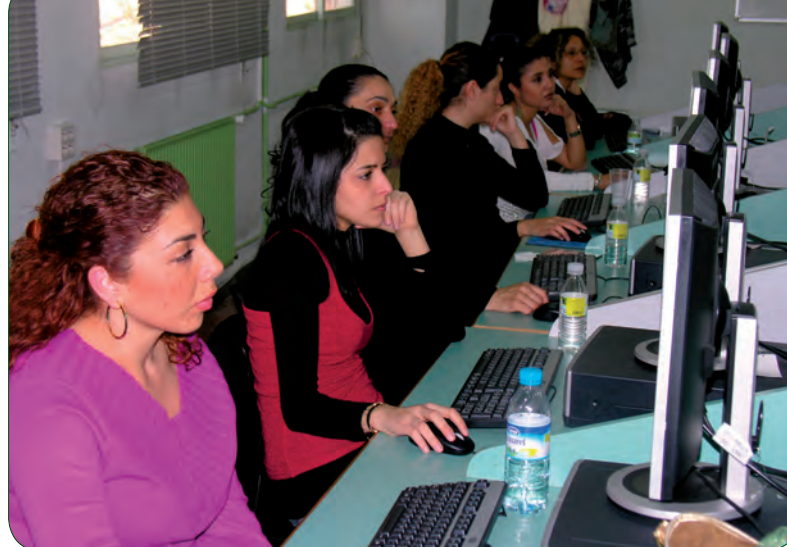
WOMEN IN THE PROJECT "ROMINET" CLASSROOM

The Roma Women's Group (Spanish acronym GMG ) has been forged and consolidated over the last several years and now in 2008 has 23 members. This is a heterogeneous group formed by Roma professionals of different ages, levels of training and styles of expressing their identity as Roma women. What all of these women have in common is their determination and interest in improving the condition of all Roma women both within and outside of their community by seeking the strategies considered most suitable and giving rise to different profiles which are complementary and mutually enriching. We are witnessing a very strong shift in the situation and role of Roma women. The GMG is a forum for meeting, debate and participation where members mutually support one another in the arduous task of bringing about change and overcoming