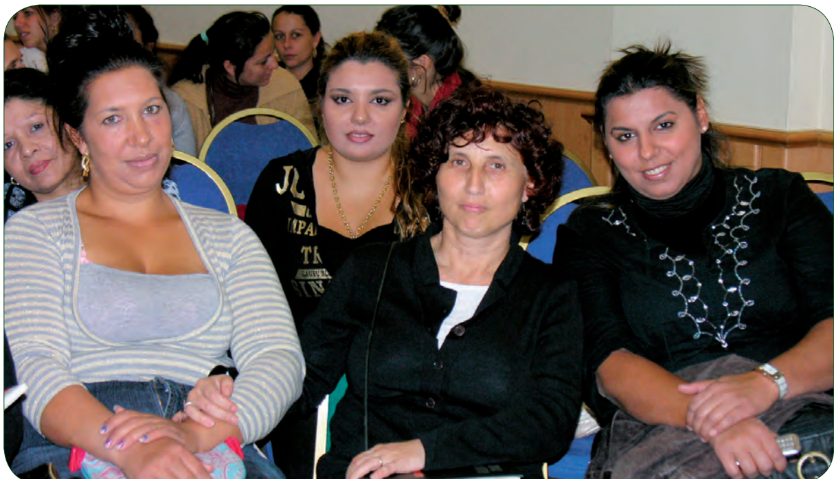
WOMEN 2007 SEMINAR

Although great progress has been made over the last several years, Roma women still have hurdles to overcome in terms of access to employment, education, social and political participation and entertainment and free-time activities. Many of these barriers are the result of stereotypes and prejudice which hinder further education for