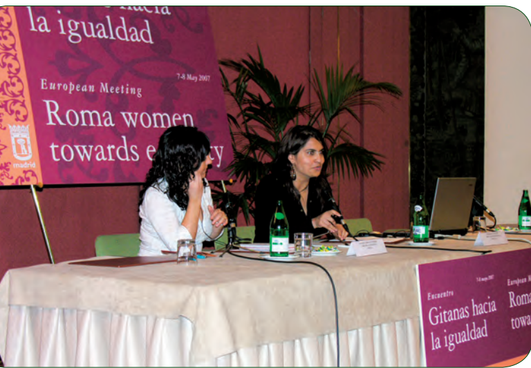
INTERNATIONAL SEMINAR OF THE ROMA WOMEN