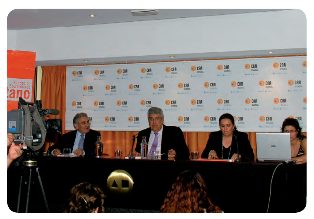
SIGNING OF THE AGREEMENT WITH THE SOCIAL WORKS DIVISION OF CAJA DEL MEDITERRANEO

The FSG's management of a part of the Operational Programme to Combat Discrimination allowed the Foundation some years ago to establish a number of agreements with local and regional administrations focusing