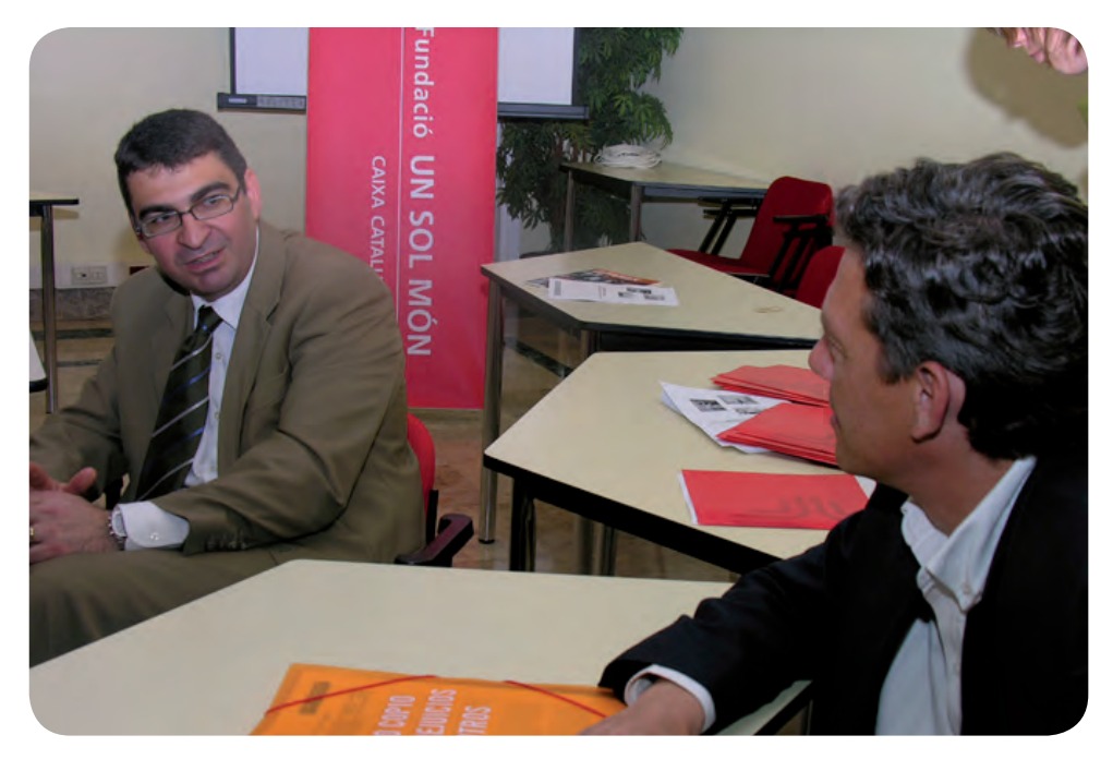
SIGNING OF THE AGREEMENT WITH THE UN SOL MON FOUNDATION OF CAIXA CATALUNYA

And finally, once again the FSG has received a positive evaluation from the Lealtad Foundation for the publication of its annual report reflecting aspects of quality and transparency in its work with social entities. In this connection, the FSG continues to work in collaboration with other entities forming part of the NGO Quality Network for the development of quality strategies, management tools and standards.